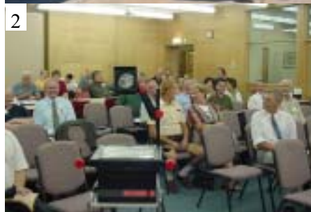
1. Presbyterian College in Melbourne 2. Conference attendees