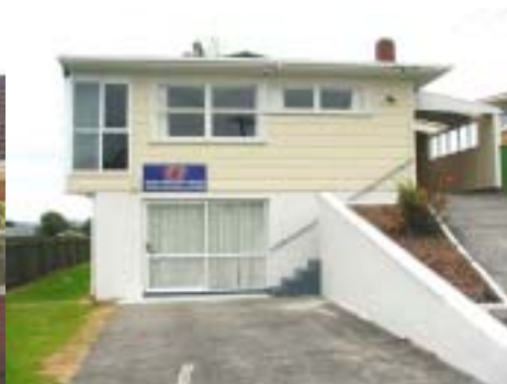
Old and New: Grace College's premises for the first 8 years at 150 Great South Rd, Manurewa, and new home from October 2002 at 75 Rogers Rd, Manurewa