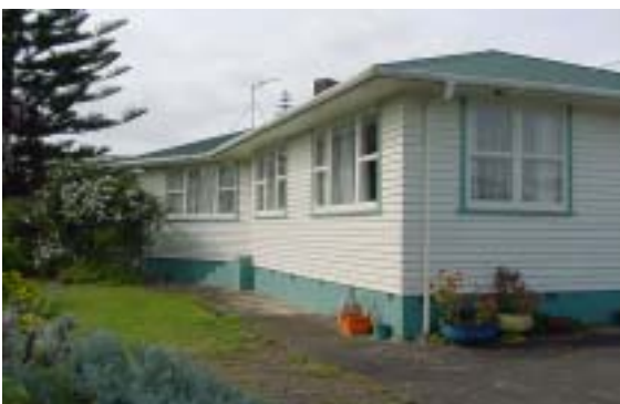
Grace College House

Another feature of 2004 was the purchase of "Grace College House". This property, bordering