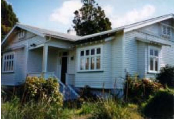
The property bequeathed