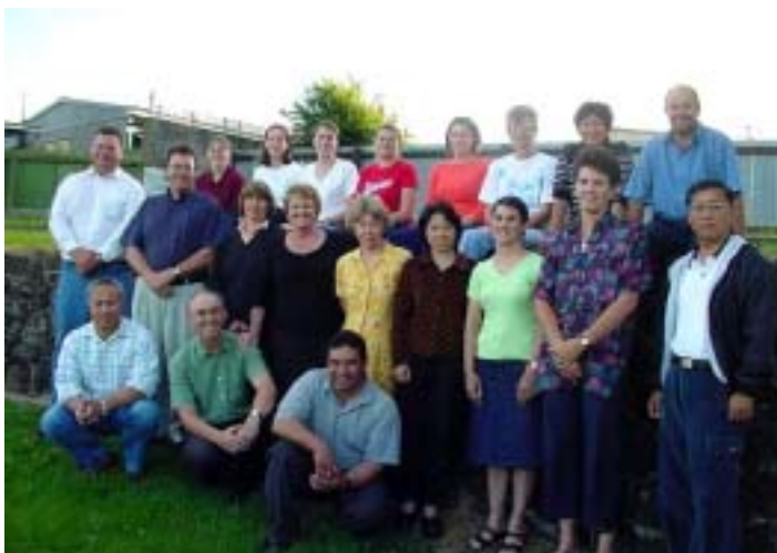
The 2003 Lay Counseling Class