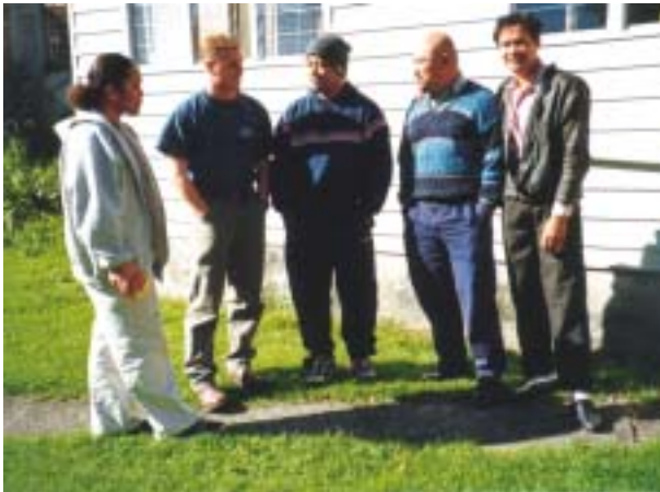
Some Discipleship school attendees