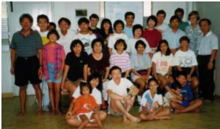
Ministering in Singapore