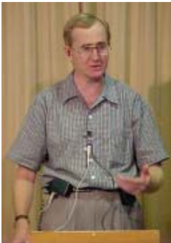
Wired for the phone link