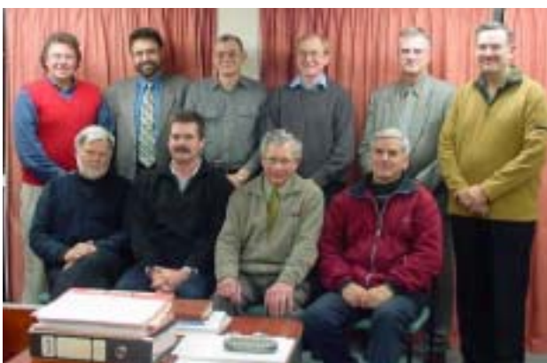
GTC Trustees and Board in 2003