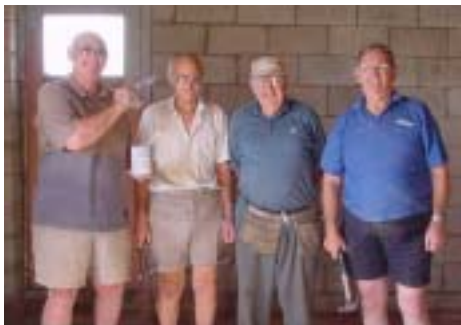
Our master builders and their finished work: new premises at 75 Rogers Rd

However, developments in the St. Andrews congregation in 2001-2002 had signalled that the College would not be able to use this facility forever.