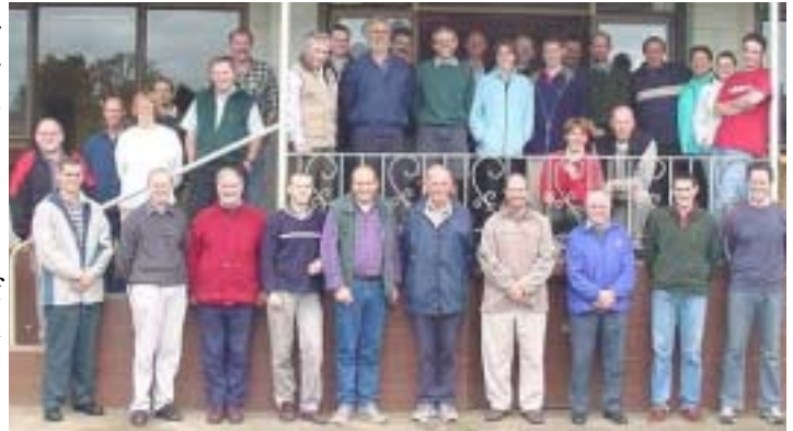
“Setting Churches Alight” Conference in Auckland

Second, we want you to see the goodness and faithfulness of God to GTC through the years. As we noted in our last issue of Grace Alone , the College began as a faith venture with the feeblest of human and material resources. From a purely human perspective, a “puff of wind” would have threatened its existence. But it has continued and grown. More than that, it has become a place where people young and old can experience the grace of God through his Word and through genuine fellowship and servant ministry. And for