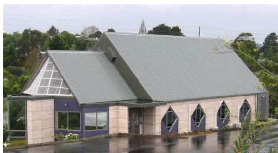
North Shore Reformed Church— site of our new campus on Auckland's North Shore

Our 2007 graduation is to be held on December 14, at 6 p.m. at the Covenant Kids pre school in Beaumonts Way, Manurewa. Like previous years we will begin with a BBQ dinner which will be followed by the graduation service. All are welcome to attend.