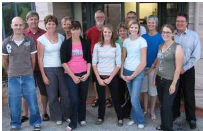
Staff and Students at North Shore Campus

The second aspect has been the greater emphasis in recent years on “on the job” theological training. In some ways this is akin to the old apprenticeship system – a mix of practical learning and applying