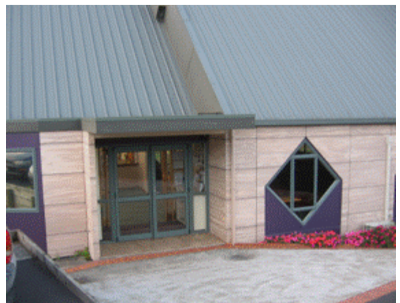
GTC's North Shore Campus, 74 Trias Rd, Glenfield

Thank you for praying with us for all these students. May the Lord be pleased to raise up more leaders for preaching, teaching and serving in his church, both in New Zealand and overseas.