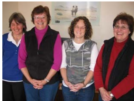
Ladies' retreat... see p.5