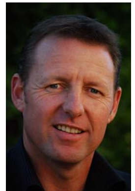
Off to Africa... see p.4