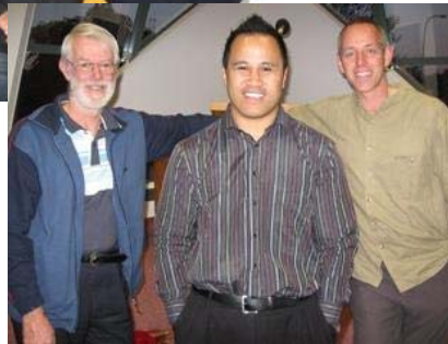
Trainee preachers... see p.6