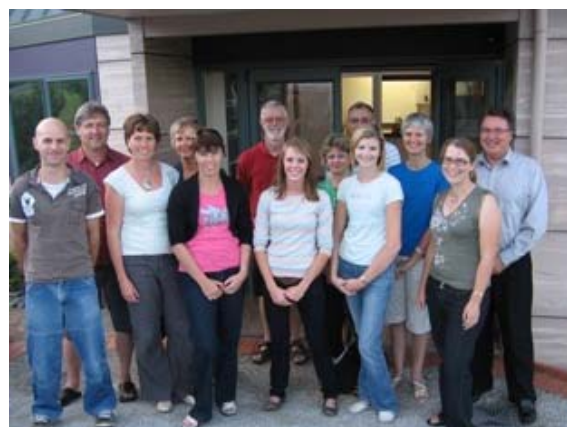
Staff and Students at North Shore campus

"Lean not on your own Understanding"... see p.2