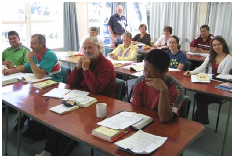
Systematics Class 2009