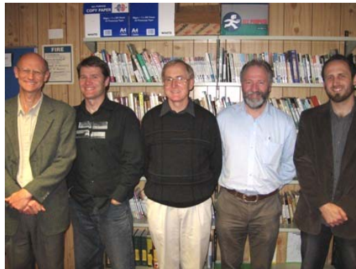
Calvin Symposium ... see p.6.