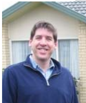
Visiting speakers... see p.7