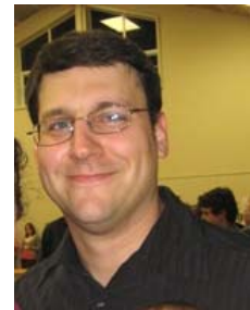
New lecturer... see p.4